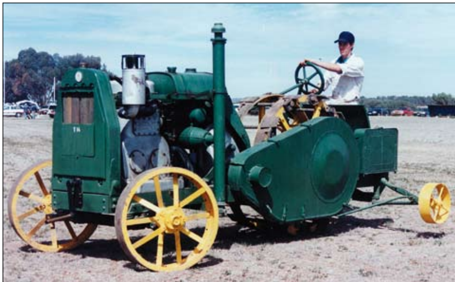
The actual Benz Sendling as described in the text. The unit is being demonstrated by Greg McCallum in the grounds of the Booleroo Steam and Traction Preservation Society Inc in South Australia, home to an internationally acclaimed tractor collection.

These cabs were so gutless that it was not uncommon, when driving up the original, near perpendicular, one way Spit Hill at Seaforth, for passengers to be requested