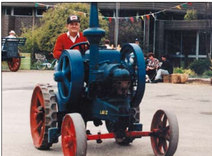
The author pictured driving the only known Lanz HL in Australia, where it is on display at the fabulous Warracknabeal Wheatland's Museum – a must see for all tractor buffs!