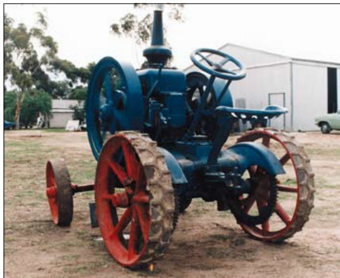
A rear view of the old Lanz at Warracknabeal.