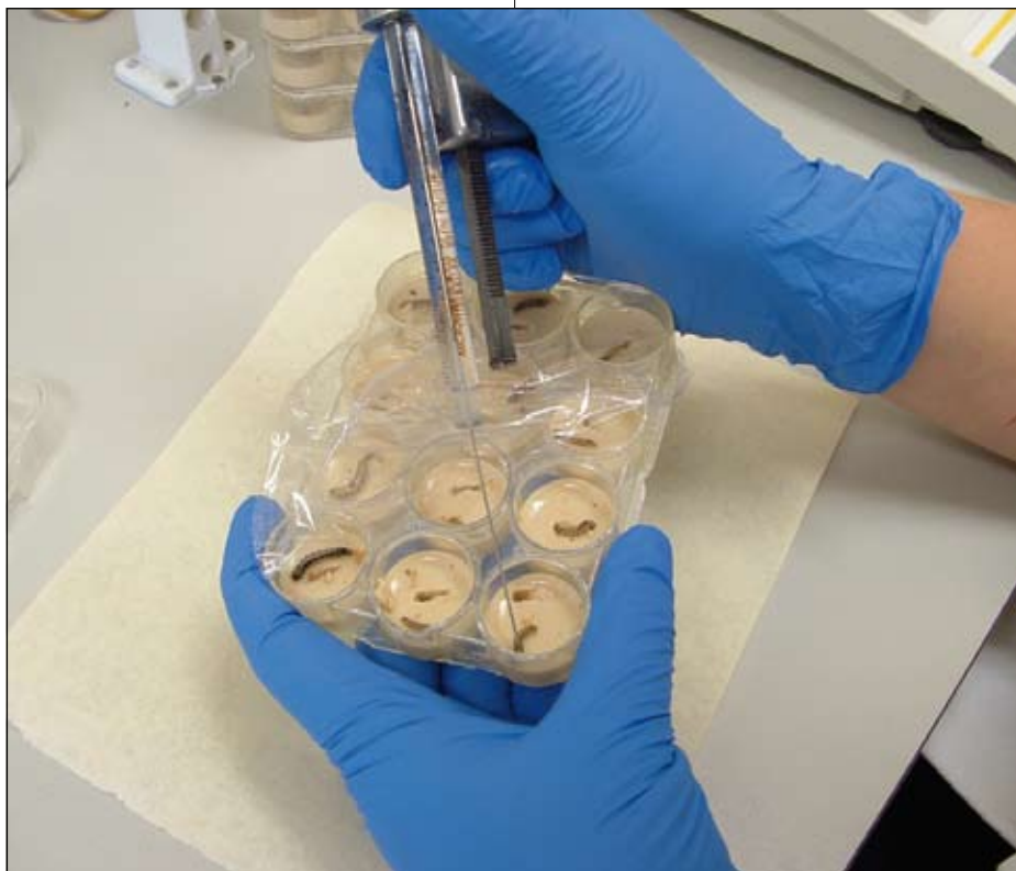
Testing for Helicoverpa insecticide resistance at the ACRI, Narrabri.

Both scenarios allow for resistance carryover between seasons.